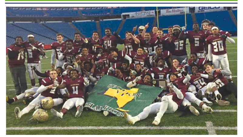
Lancaster - Class AA