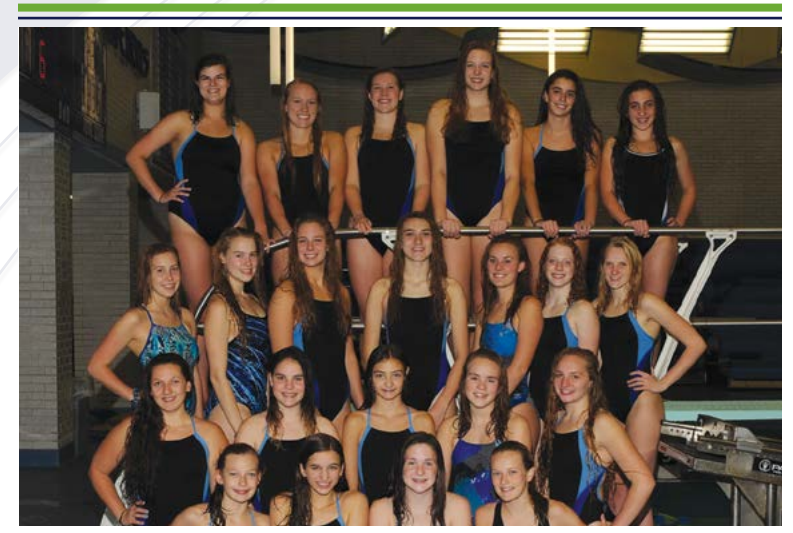
Orchard Park - Class A