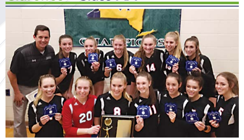
East Aurora - Class B