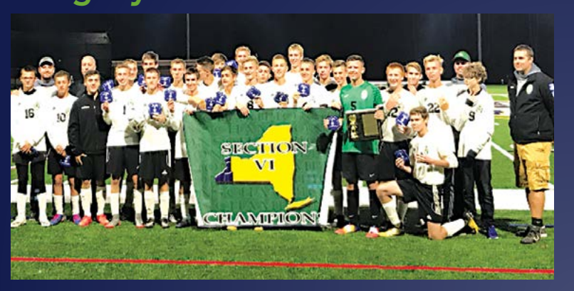
East Aurora - Class A