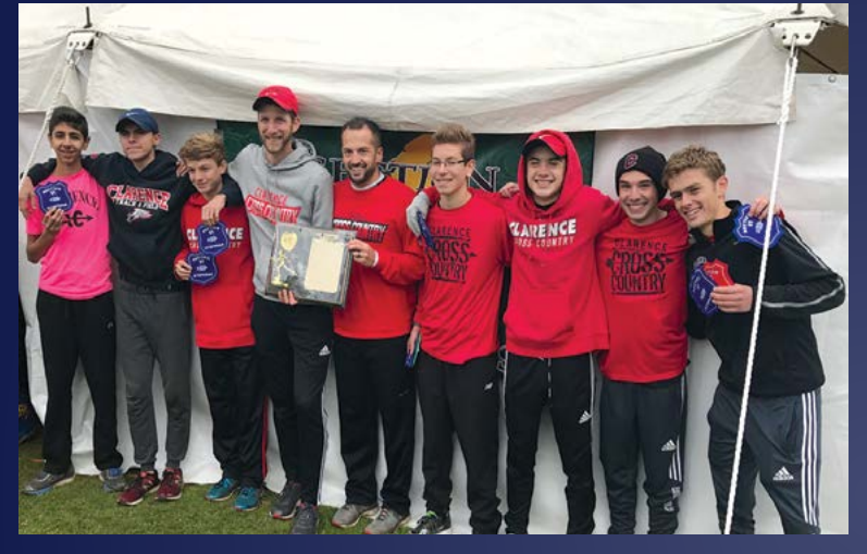
East Aurora - Class B