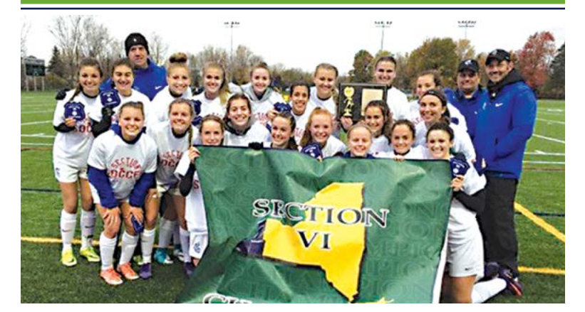
North Collins - Class D